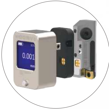
DIGITAL ES-BORE WITH ADAPTER PLATE

NOTE: ES-Bore digital fine boring cartridges must be used with the new 3E TECH+ and adapter plate. The ES-Bore cannot be used with 3E TECH .