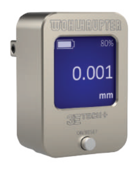
3ETECH+ Digital Readout Module